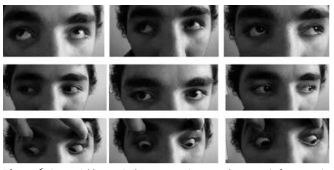
Figure 6. Case 2, Adduction had spontaneously returned to normal after a month. There was still 30 PD exotropia, which was also present in his previous history