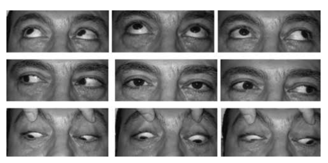
Figure 3. Case 1, at 8 months postoperatively, there was no face turn or exotropia in primary position, and 14 PD exotropia in the left gaze position