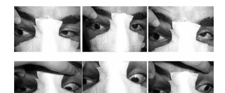
Figure 4. Case 2, adduction was limited about 15 degrees temporal to midline. There was a 45 PD exotropia in the primary position, increasing to 90 PD on left gaze and decreasing to 14 PD on right gaze without proptosis. Forced duction test was negative