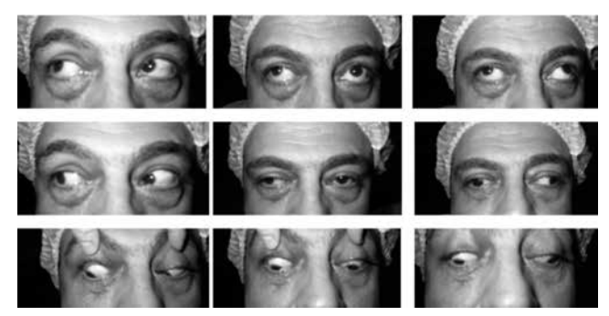
Figure 1. Case 1, 75 PD exotropia in the primary position, increasing to 90 PD on left gaze and decreasing to 14-16 PD on right gaze

In recent years, functional ESS (FESS) has become the primary surgical preference for the treatment of medically resistant obstructive sinus disorders. Although a relatively safe procedure, ESS may cause either minor or major complications.<sup>3</sup> The most common ophthalmic complication is orbital hemorrhage, while other reported orbital complications include optic nerve injury, strabismus and nasolacrimal drainage system injuries.<sup>4</sup> Ocular motility dysfunction may