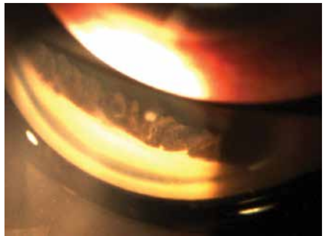
Figure 2. Gonioscopic photograph of the right eye showing the ciliary processes before transpupillary argon laser cyclophotocoagulation