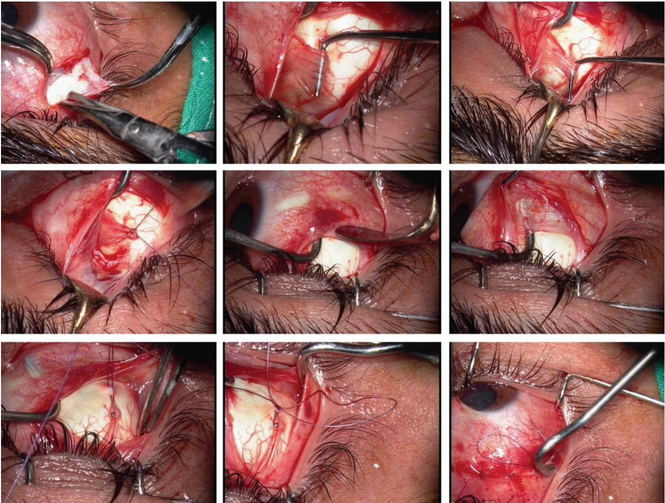
Figure 3. Modified Harada-Ito procedure with adjustable suture technique

excyclotropion, and left hypertropia in right gaze and right hypertropia in left gaze are suggestive of bilateral SO palsy. 1 Managing bilateral acquired SO palsy may be difficult because of the considerable amount of torsion, but bilateral HI surgery can successfully reduce extorsion and alleviate symptoms in these patients. 2 To improve the success of surgical treatment, the HI procedure should be used in patients with primary complaints of torsion in particular.