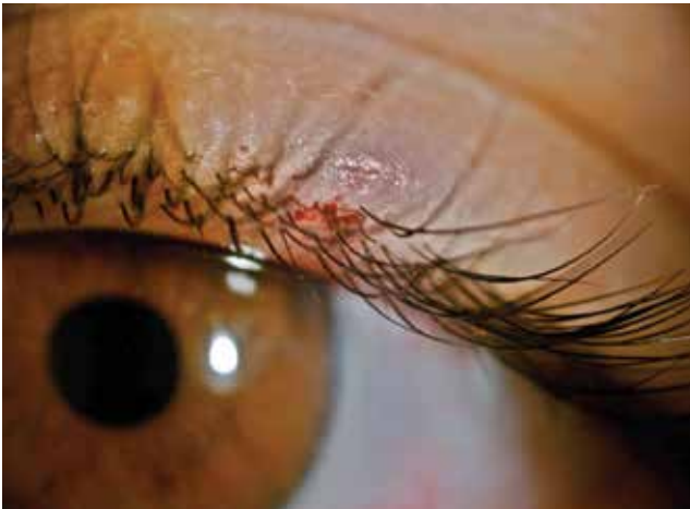
Figure 1. Tick infestation of the left superior eyelid of a 15-year-old female patient. Mild hemorrhage and ecchymosis of the eyelid are apparent. The tick's body was severed due to inappropriate extraction method

A 66-year-old female patient presented to our clinic with complaints of itching and stinging in her right eye. During routine examination a tick infestation was discovered incidentally on the patient's left lower eyelid (Figure 2). However, no accompanying findings were apparent in the eyelid or eye. It was learned that the patient lived in a rural area, but she reported no contact with any animals. The tick was carefully removed using toothless forceps with curved, blunt medium tips. Complete removal of the tick was confirmed by slit-lamp examination, and 10% povidone iodine was applied to the area. The patient was prescribed topical tobramycin/loteprednol etabonate eye drops (instilled four times a day) and fusidic acid eye drops (twice a day). Hemogram, biochemical and serologic tests were