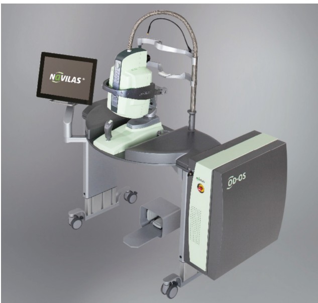
Figure 4. The Navilas system with integrated fundus camera