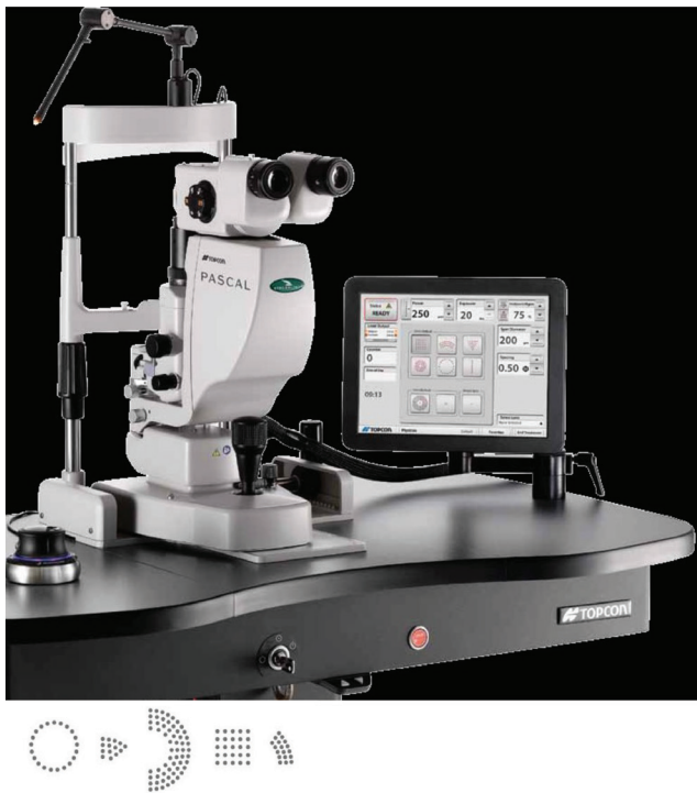
Figure 1. The PASCAL 532 nm instrument and panel showing available treatment patterns

As with the PASCAL, the spot number within a pattern can be adjusted from 1 to 36 depending on the pattern type and spot size. Valon's most important feature, not shared by the PASCAL, is that the settings chosen with the joystick are displayed over the retinal image. This feature eliminates the need for physicians to look away from the microscope while making adjustments, thus saving time spent to focus back on the retina. Spot sizes of 50, 100, 200 or 300 µm can be selected from the microscope.