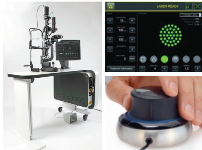
Figure 2. Valon laser instrument, screen and joystick

In a randomized, prospective study of 101 patients undergoing peripheral laser photocoagulation for various reasons, Röckl and Blum 14 applied conventional single spot laser therapy in 35 patients (group A) and MSL therapy using the Visulas 532s VITE in 66 patients (group B). Spot size was consistent between the two groups (300 µm), while pulse duration was 100-150 ms for group A versus 20 ms for group B. Laser power was adjusted to produce moderate burns and the treatment time was recorded. After the procedure, patients were asked to rate their pain from 0 (painless) to 10 (maximum pain). Treatment time was shorter in group B than in group A. In group A, 46% of the patients