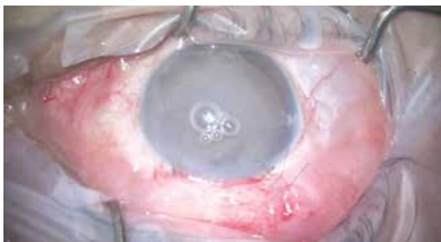
Figure 1. Triamcinolone acetonide is visible in the anterior chamber after postoperative intracameral injection and can be seen flowing into the subconjunctival space via the fistula