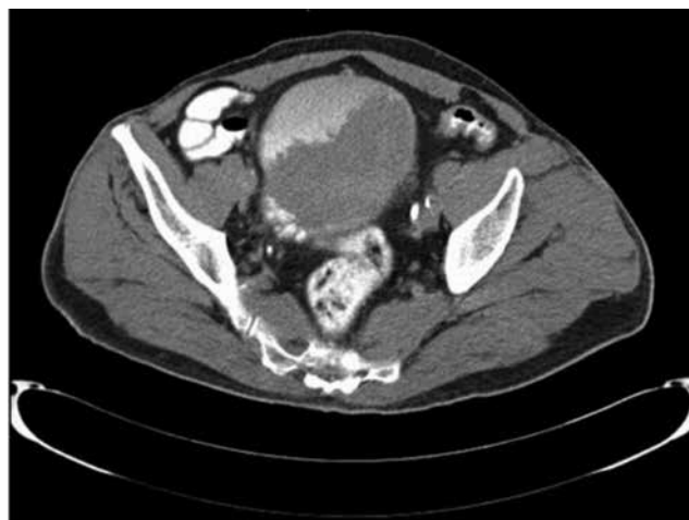
Figure 5. Abdominal computed tomography showing mass in the bladder