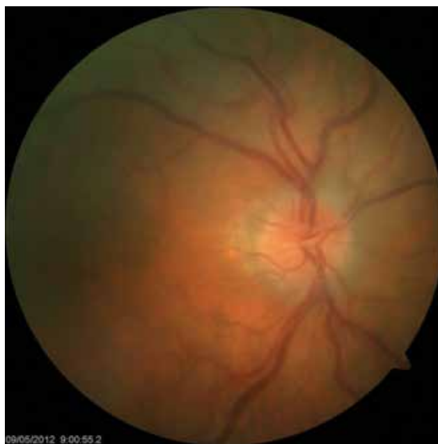
Figure 1. Fundus photograph of the right eye showing mild vitritis with increase in vascular tortuosity

Carcinomas predominate as the primary lesions that produce ocular metastases. Ocular metastases are hematogenously disseminated and most commonly affect the uveal tract. In our case, the presentation was in the form of a rather benign unilateral anterior uveitis without the involvement of the posterior segment, which misled us to a diagnosis of idiopathic anterior uveitis after an initial etiological investigation overlooking