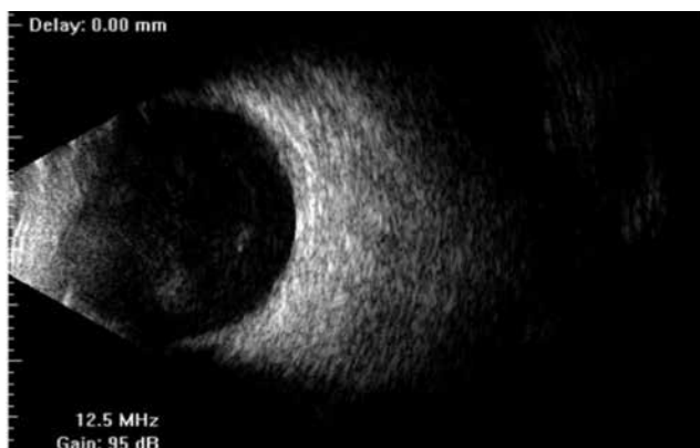
Figure 4. B-scan ultrasonography showing clear vitreous with no choroidal thickening and no exudative retinal detachment in the right eye