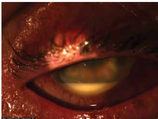
Figure 3. Severe anterior chamber reaction and hypopyon in the right eye

The coexistence of bladder carcinoma and ocular inflammation in our patient may be explained by several possible pathophysiological mechanisms. The presence of bladder carcinoma with the anterior chamber reaction may be completely coincidental. Nevertheless, the cessation of ocular inflammatory findings after the resection of the tumor led us to search for a relationship between the two entities. The cessation of ocular inflammation despite the absence of a curative treatment for the ocular disease or a systemic chemotherapy supported the evidence of absence of any malignant cells in the ocular tissues and pointed to the remote effects of the malignancy presenting as ocular inflammation. The cytologic examination of the aqueous