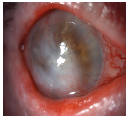
Figure 2. Complete resolution of keratitis with residual corneal scarring