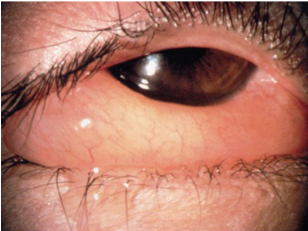
Figure 1. Chemosis in ocular hypersensitivity disorders