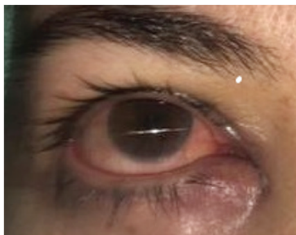
Figure 1. Clinical appearance of the right inferior punctum before treatment in a patient with primary canaliculitis. Hyperemia of the conjunctiva and edematous inferior canaliculus are evident

In surgical treatment, after local anesthesia, a Bowman lacrimal probe was passed into the affected canaliculus and an incision was made with a number 11 blade in the affected canaliculus. Canalicular curettage was performed using a chalazion curette. The canaliculi were irrigated with cefuroxime (750 mg/mL, 6 mL). The patients were treated with hot compresses and topical fluoroquinolone 8 times daily for 10 days. After canaliculotomy, intracanalicular cefuroxime was applied daily for the first week, then weekly for one month.