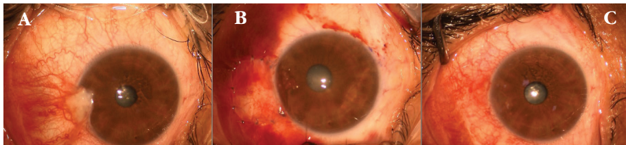
Figure 1. The second patient operated using the double flip technique. A) Preoperative appearance of pterygium. B) Early postoperative appearance of the autograft. C) Postoperative 1-month appearance of the autograft

Numerous methods have been used for the treatment of pterygium and the prevention of pterygium recurrence. The bare sclera technique allows re-epithelialization of the scleral bed after simple excision of the pterygium. This approach is appealing due to its short surgical time and easy application, but it is rarely used today due to the high risk of recurrence (24-89%). 7 Conjunctival autografting involves covering the exposed scleral bed after pterygium excision with a free autograft from the